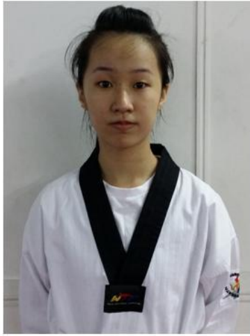
T-shirt neckline must be at collar bone level