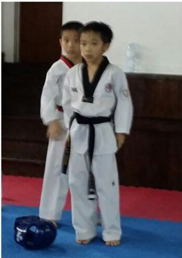
Poom belt holder wearing black belt uniform