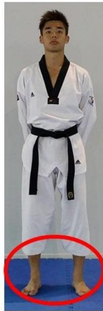
Pants too short