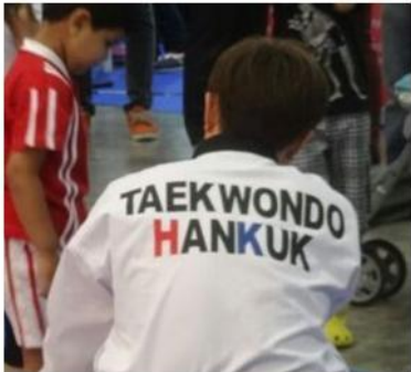
Not STF wordings