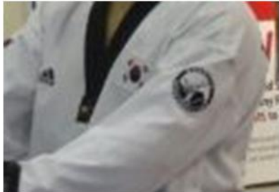
Not STF logo