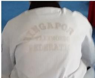
Faded STF wordings