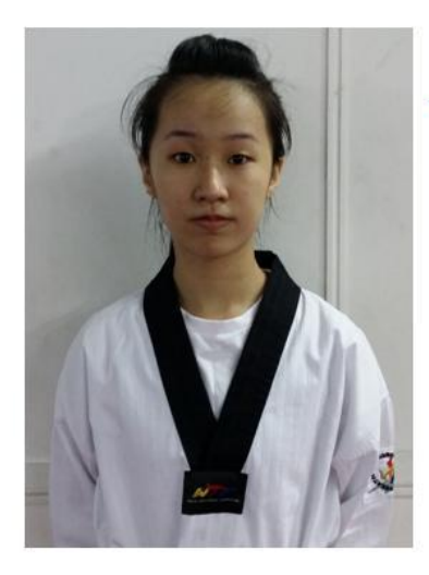
T-shirt neckline must be at collar bone level