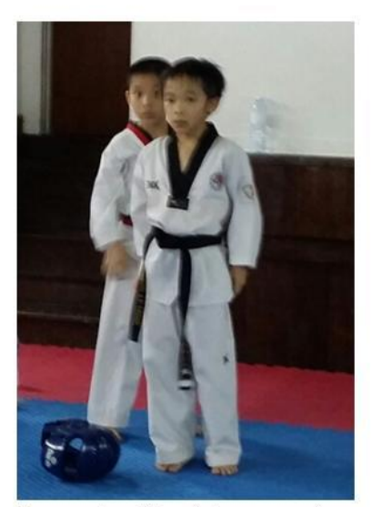
Poom belt holder wearing black belt uniform