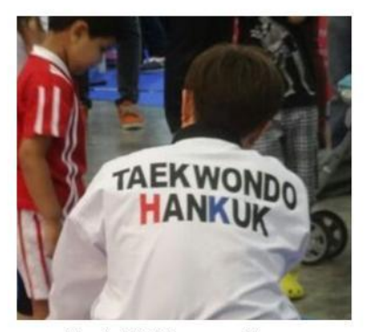
Not STF wordings