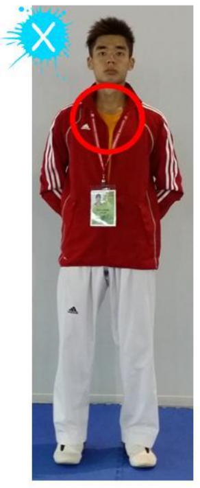
Round neck tee exposed