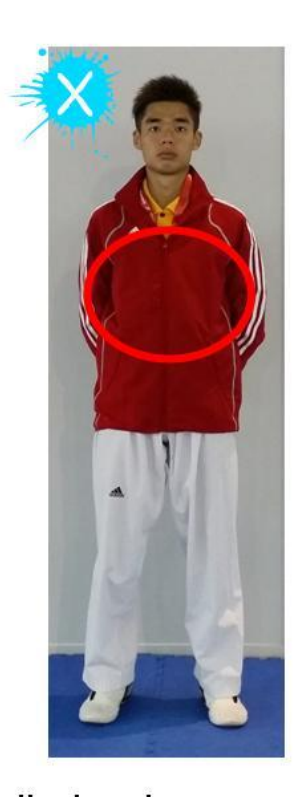
Coach Pass not displayed or not properly displayed