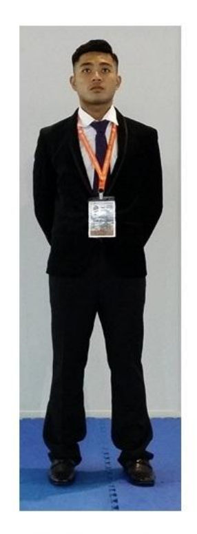
Black shoes are allowed only with working pants