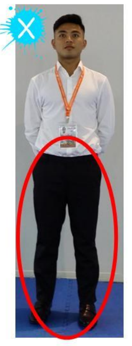
Jeans not allowed