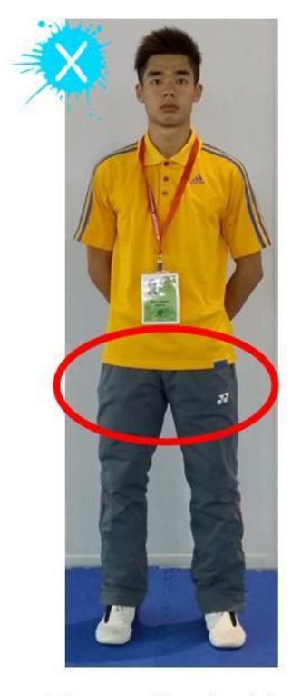
Top not tucked in